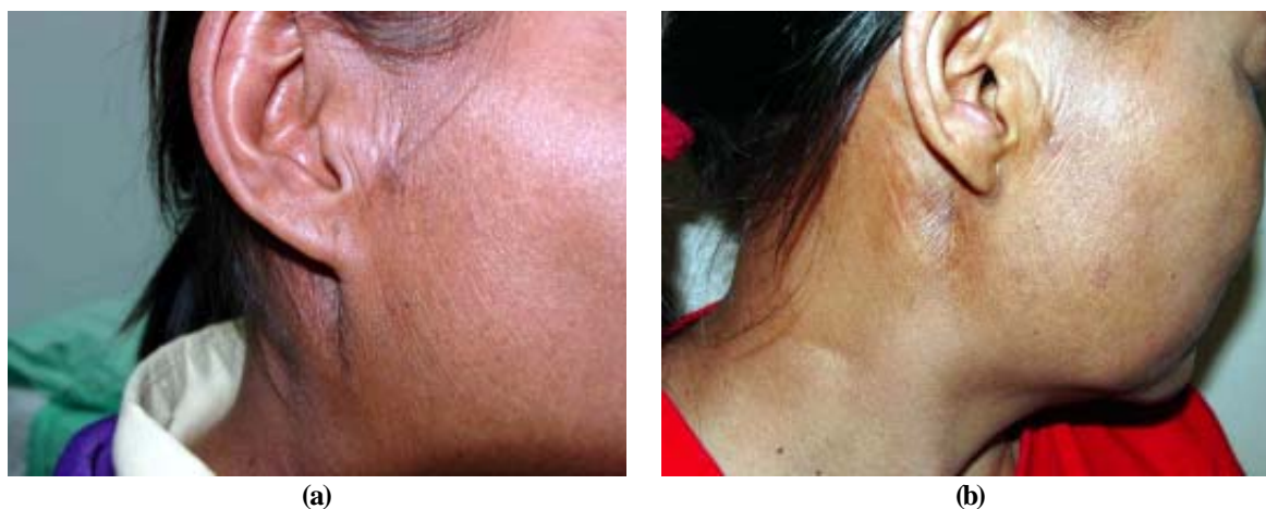
Fig. 2 Photographs of case No. 5 (a) before radiotherapy (b) after radiotherapy

Surgery, radiotherapy, and steroid therapy have been tried, but none has proved to be the optimum modality. Steroid therapy has produced marked response in reduction of tumor size, but after weaning, the tumors often increase in size (11) . Surgery with complete excision is very difficult because the infiltrative nature of the tumor and swelling of regional lymph nodes (11) . Five patients (62%) in the present study were treated by local excision/radical surgery before. All of them eventually had local recurrence after surgical excision from 1-15 years (mean 4.8 years). However, the authors could control this recurrent disease with radiation therapy.