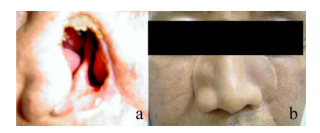
Fig. 3 The picture (a) showing surgical defect of the left nose and nasal prosthesis (b)

electrolyte imbalance. Surgical treatment was done after his condition was stable for general anesthesia. He received endoscopic debridement five times and was treated with intravenous amphotericin B sequentially up to 2 grams. Two months later, he was discharged from the hospital and referred to Mahidol University Faculty of Dentistry for nasal prosthesis (Fig. 3). He had been followed up for 2 years with no recurrent disease.