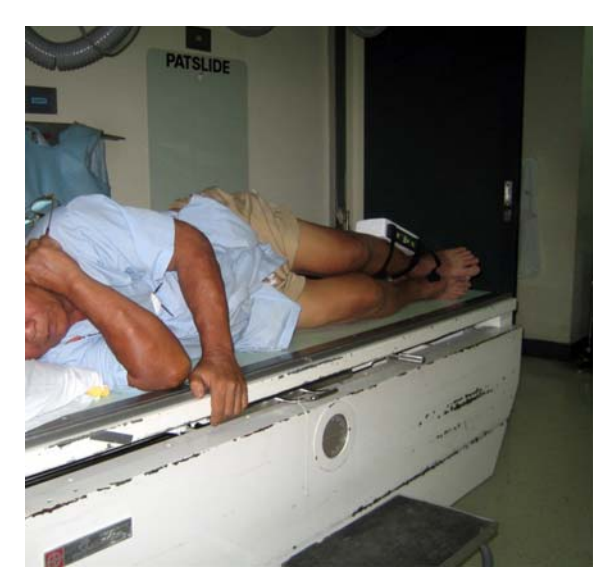
Fig. 4 Positioning of the patient on the table with the DCG instrument mounted on the leg