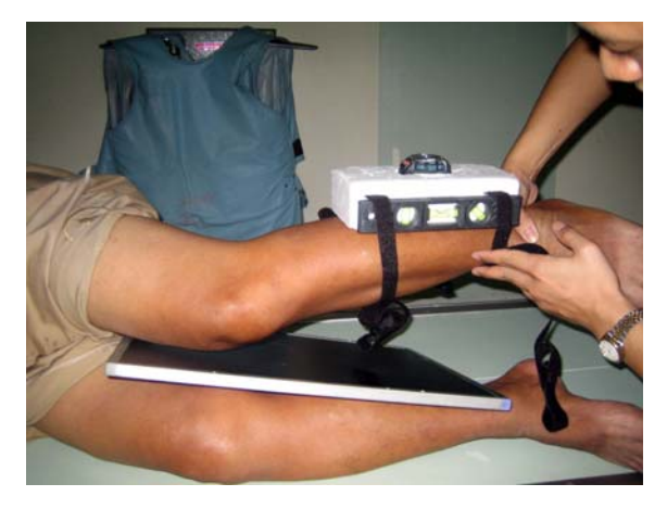
Fig. 5 The inclinometer was checked to control plane of measurement. The angle read on the digital compass was recorded at the same time as the roentgeno-graphic picture of the knee was taken.

The DCG displayed the direction in the numeric degree by reference from the North Pole. The number read from flexion and extension position was calculated with reference to zero degree to obtain an actual range of knee joint movement in horizontal plane. On the lateral knee film, the long axis of the femur and tibia was drawn. The angle formed by an intersection of these two lines was measured by standard handheld goniometer. This measurement was done on both flexion and extension film then the two