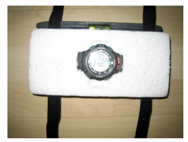
Fig. 3 A top view of the designed instrument, note an inclinometer along the side and a digital compass angle finder on the top of the platform with a Velcro strap