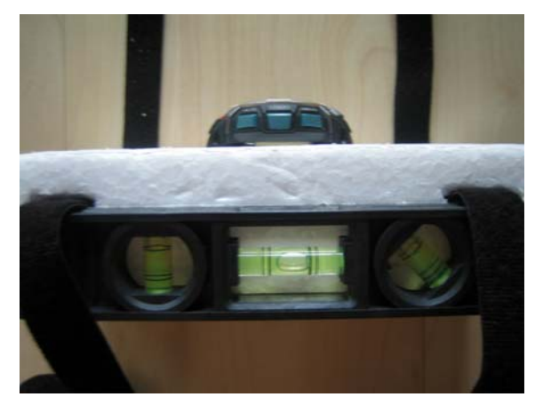
Fig. 2 A fluid base inclinometer with a digital compass angle finder mounted on the stable platform