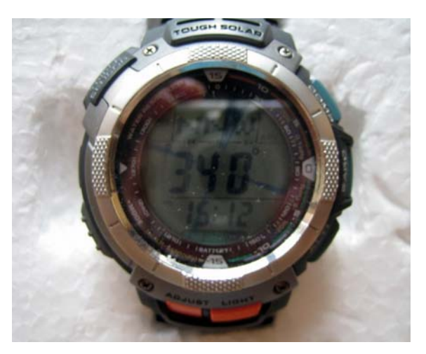
Fig. 1 A front view of the digital compass angle finder

The fluid level in the inclinometer was checked to control the horizontal plane between the leg and the digital compass in both flexion and extension position. This is done to ensure that the goniometer measured only a single plane of motion. Fig. 6 shows a fundamental function of the compass. The 360 degrees radius was divided by 16 directions. Each segment equaled 22.5 degrees.