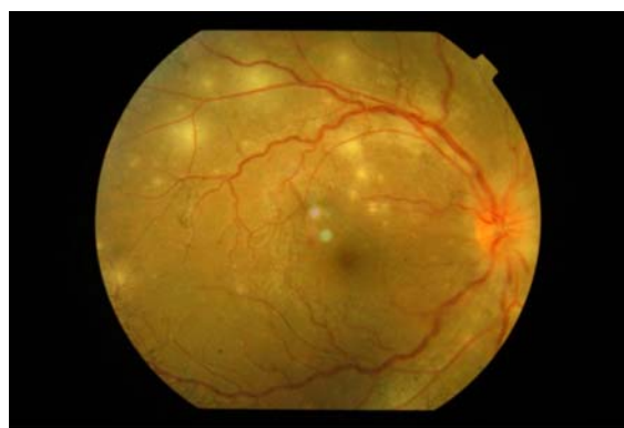
Fig. 1 Ophthalmoscopic appearance in the right eye on the initial visit. Optic disc edema and the absence of vitreous or signs of active vasculitis

The patient, then, was admitted to the hospital for intravenous and intravitreal treatment. Intravenous acyclovir, 500 mg every 8 hours, was