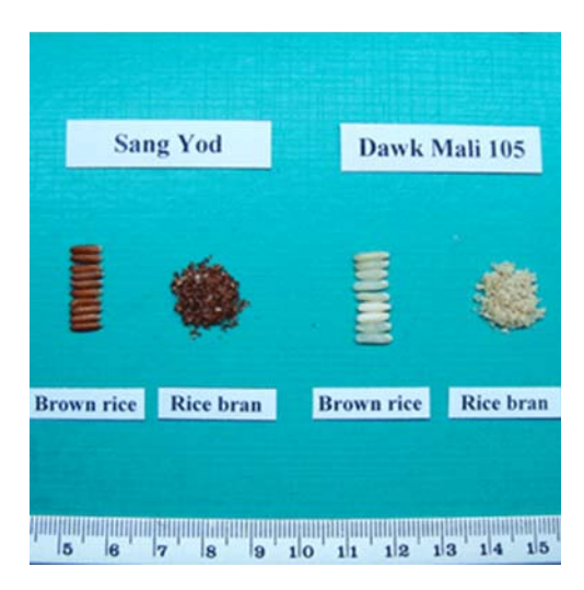
Fig. 1 Brown rice and rice bran of Dawk Mali 105 and Sangyod used in this study.

Brown rice and rice bran powder of Sangyod and Dawk Mali 105 were obtained by milling rice grains in a local grinding mill (Fig. 1). The water-soluble extract of rice bran of each cultivar was prepared by heating the rice bran powder (1 kg) in 60-75°C distilled water (4 L) for 15-30 minutes. Next, the extract was left for 1 h at room temperature to cool down and was then filtered