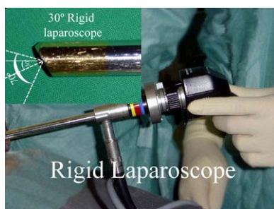
A 5254; Olympus

Final histology showed 10 benign goiter, and 3 cystic nodule. There was no post-operative complication, no subcutaneous emphysema, and no voice changing. The cosmetic results were considered excellent in all the cases.