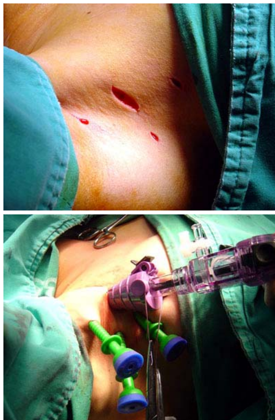
Fig. 1 Incisions and port positions

The 12 mm blunt tip trocar with smooth sleeve (Endopath Tristar 512 B; Ethicon Endo-Surgery, Cincinnati, Ohio, USA) was fixed with nylon # 3-0. The carbon dioxide was insufflated at 4 mmHg. The Fujinon 4-way tip deflection flexible laparoscope (EL2-TF410; Fujinon, Tokyo, Japan) for flexible-Fujinon group, the Olympus Laparo-Thoraco Videoscope (LTF-V3 Viscera; Olympus Optical, Tokyo, Japan) for flexible-Olympus group and the 10 mm, 30 degree rigid laparoscope (A 5254; Olympus Optical, Tokyo, Japan) for rigid laparoscope group were inserted through the 12 mm port. Then the instruments were inserted through the 5 mm ports. The Harmonic Scalpel (5 mm diameter, 33