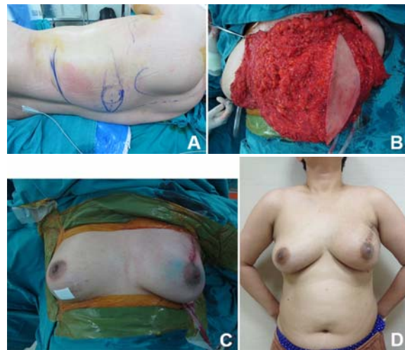
Fig. 1 A 45-year-old woman with left breast cancer. A) Preoperative planning photographs, showing the design of the skin paddle. B) The extended latissimus dorsi (LD) flap is placed on the chest wall, after left nipple sparing mastectomy (NSM). C) Immediate postoperative result after left NSM and extended LD flap, anterior view. D) Results at 3 months after left NSM and extended LD flap, anterior view.

The initial incision is made at the superior border of the flap to identify the LD muscle and the descending branch of the thoracodorsal artery. For the LD flap, subcutaneous tissue dissection includes the parascapular, scapular and some part of lumbar fat, while