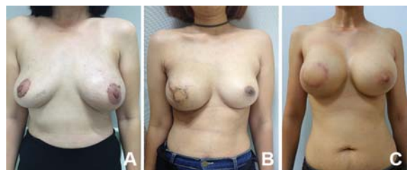
Fig. 4 Postoperative results after LD flap with prosthesis in three patients. A) Results at 1 month after right NSM and LD flap with prosthesis, anterior view. B) Results at 3 months after right SSM and LD flap with prosthesis, anterior view. C) Results at 6 months after right SSM and LD flap with prosthesis, anterior view.

formation. Quantitative data was divided into two categories using cut-off values determined by the Yuden Index, or the mean and median, as appropriate. Risk factors with p -value smaller than 0.10 from a univariable analysis were entered in a multivariable logistic regression model, with backward stepwise selection, to identify the final best set of independent risk factors.