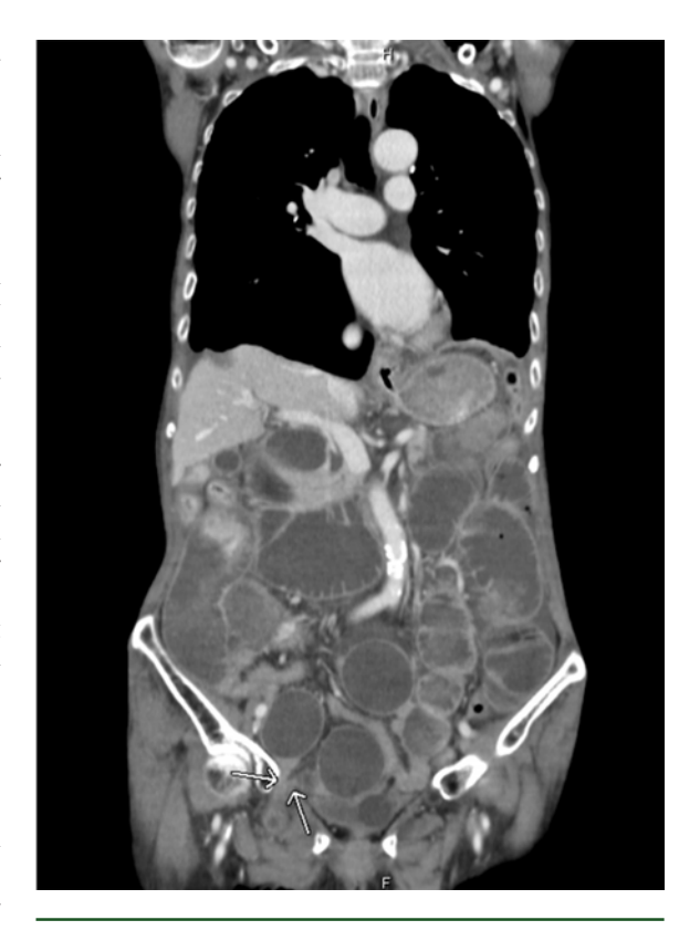
Figure 1. Shows incarcerated right obturator hernia containing small bowel loop with high grade small bowel obstruction.

The general recommended treatment for obturator