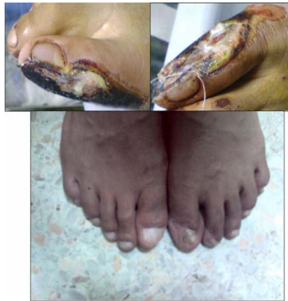
Fig. 4 A drunken 23 year-old man was presented with exposure of bone and joint of both great toes due to sitting behind the motorcycle driver, dropping both feet on the road and dragging them along it. Consequently, his great toes had been debrided (above left and right). Treatment was performed with debridement and placement of nanocrystalline silver dressing alone as an out-patient program for 2 months. Completed healing without skin graft was achieved (below).