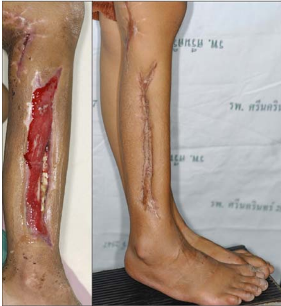
Fig. 5 A 13 year-old man was presented with fractures of both bones of the right leg (Gustilo-Anderson grade 3B) post debridement and internal fixation and the wound exposed the fibula with a single remaining artery (left). After placement of nanocrystalline silver dressing alone in the out-patient program for 3 months, the wound was completed healed by secondary intention (right).

promotes increased growth factors, matrix production and cellular proliferation (9) . Some parts of the body like hand, forehead, foot and toe, however, are very difficult to provide coverage with vacuum assisted wound closure because of air leaks and failure of negative pressure. In these cases, a nanocrystalline silver dressing was applied to the wound and the result was the development of granulation. This treatment also decreased cost of treatment by using the out-patient program which can typically be two to three dressing per week.