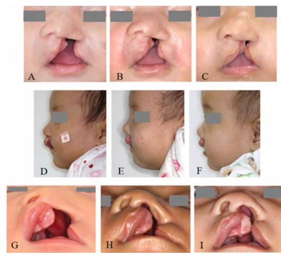
Figure 4. Example of a patient undergoing the KGU PNAM therapy (A, D, G) pre-treatment (B, E, H), two weeks after initial visit (C, F, I) and prior to cheiloplasty.

Nostril widths on the cleft side had decreased significantly at T2 to T3, and T1 to T3. Nevertheless, they were maintained during the first 14 days of therapy. The possible reason could have been a result of insufficient force amid extraoral strapping in the transverse direction, thus resulting in less of an effect rendered on nostril width. These results were in accordance with numerous publications that evaluated nose and lip changes amid different types of PNAM utilisation (8,12,14,15) . On the other hand, there were no significant changes in nostril width on the cleft side after 100 days of