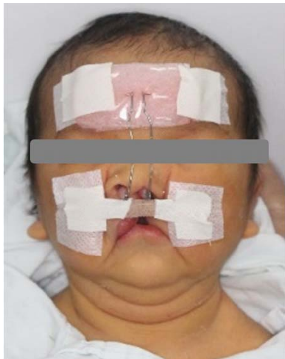
Figure 1. Infant with lip strapping and nasal molding device.