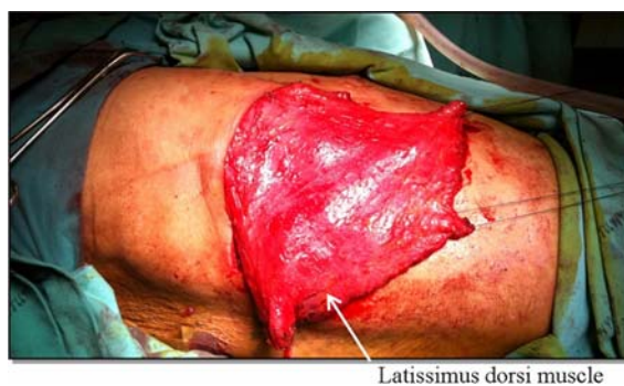
Fig. 3 The latissimus dorsi muscle harvest is complete.

transfusion of an average of 270 mL of packed red blood cells (PRC) per patient and eight patients needed ICU for 1 to 9 days (mean = 2.38 days). Mean length of hospital stay was 13.27 days (7 to 40 days).