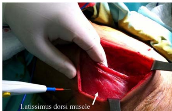
Fig. 2 The superior edge of the latissimus dorsi muscle is elevated.