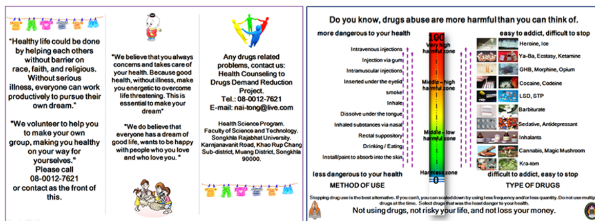
Fig. 1 Drug related harm reduction brochure.

Drug-related harm reduction was evaluated at two-week time along implementation period of 12 months. Of 46 sex workers, the total of 526 two-week periods were evaluated. Of these, 471 two-week periods were decreased drug-related harm (89.5%) while 38