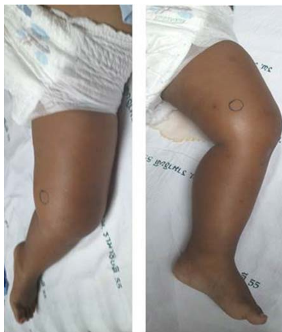
Fig. 2 The left hip was in flexion-external rotation position with the left knee swelling.

reactive protein was 54 mg/L. Serum iron was 9 ug/dL (normal ranged 35.0-150.0 ug/dL). Blood for vitamin C level was collected. The follow-up radiographs showed normal joint space of the left hip without epiphyseal or physeal irregularity. The left femur showed surrounding soft tissue swelling, osteolytic lesion and a thin periosteal formation along metaphyseal-diaphyseal area. There was also soft tissue density around the left knee indicating intra-articular fluid (Fig. 3). The ultrasonography of the left lower extremity showed unremarkable joint fluid at the left hip, heterogenous echogenicity of the left proximal quadriceps muscles