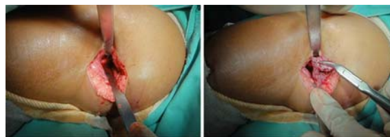
Fig. 6 The skin incision was made on the lateral aspect of the left thigh, and tissue biopsy was performed.

Scurvy was a disease caused by vitamin C deficiency. It has been recognized a long time ago (6) and discovered how to diagnose and prevent (7,8) . There are various recommendations and strategies to prevent vitamin C deficiency in children such as breast milk,