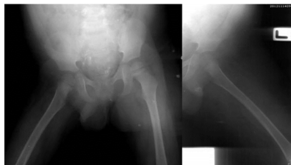
Fig. 1 The radiographs of left femur showed mild soft tissue swelling without bony lesion.

The laboratory investigations were done at Ramathibodi Hospital. The complete blood count showed white blood cell 12,970/mm 3 (neutrophil 65%, lymphocyte 27%, monocyte 7%, eosinophil 1%), hematocrit 22.5%, mean corpuscular volume 57 femtoliters, anisocytosis 2+, microcytosis 2+, hypochromic 1+; platelets 486,000/mm 3 . Electrolytes analysis was sodium 138 mmol/L, potassium 4.49 mmol/L, chloride 103 mmol/L, and carbondioxide 29.3 mmol/L. International normalized ratio (INR) was 1.12. Erythrocyte sedimentation rate was 71 mm/hr, and C-