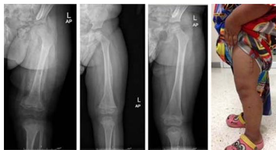
Fig. 7 From left to right, the radiographs of the left femur at one, three, and six months after the treatment. There was profuse callus formation followed by bone remodeling. The child was fully recovered.

orange juice but the disease still presents sporadically and is misdiagnosed in many reports according to different clinical presentations (5,9) . This study demonstrated the traumatic complaints in a child resulting in inability to walk for 3 weeks. Even though the bleeding gums were accompanied with a history of limited fruits and vegetables consumption leading to scurvy diagnosis which prompted treatment, the clinical course was prolonged with high fever for nearly two weeks. An infected hematoma, as well as subacute osteomyelitis was of concern. An irrigation and drainage procedure evacuated hematoma, which could be a good media for bacteria. Finally, the clinical response was dramatic during the following two days. Traumatic injury in scurvy had limited data about its clinical course. A previous study from Thailand in 2003 (1) reported the most common clinical presentations in 28 children were inability to walk (96%), followed by limb pain (96%) tenderness of lower limbs (86%), and minor trauma (46%). Other studies (2-4,10-15) documented chief complaints mostly gum bleeding, inability to walk, limb pain or swelling caused by subperiosteal bleeding (Table 1). In this study, the child had prolonged high fever for 11 days after taking standard a vitamin C supplement (300 mg/day). The radiographic findings showed extensive bone marrow enhancement from