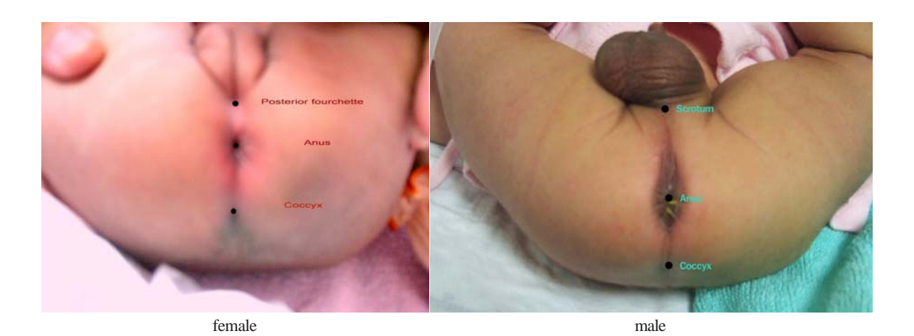
Fig. 1 Measurement of anal position index in female and in male

Among 403 newborn enrolled into the present study, 203 (50.4%) were males and 200 (49.6%) were females. The majority (88.1%) of newborns were term newborns and 10.9% were premature newborn; only 1.0% was post-term newborns. Incidence of prematurely born was not significantly different in which 20 (9.8%)