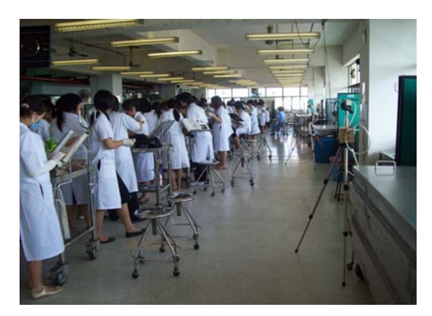
Fig. 1 Indoor air sampling