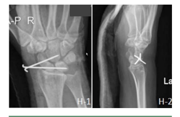
Figure 8. Immediate post-operative radiograph of wrist.