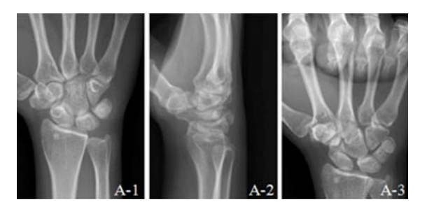
Figure 1. Radiograph of the PA and lateral view of the wrist (1, 2) and the 4 mm SL gap in stress view (3).

The approach was through a dorsal longitudinal incision. The extensor retinaculum was divided in a Z fashion and preserved for later repair. The wrist capsule was approached between the third (extensor pollicis longus) and fourth (extensor