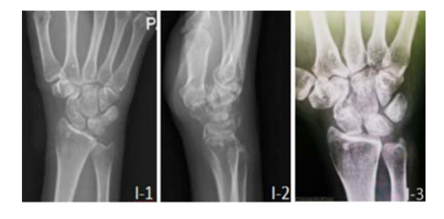
Figure 9. Post-operative radiograph 12 months after surgery. AP (I-1), Lateral (I-2), and Stress view (I-3).

In this case report, the authors introduced a simple modification of a tri-ligament tenodesis based on Chopra's technique. The same technique with the