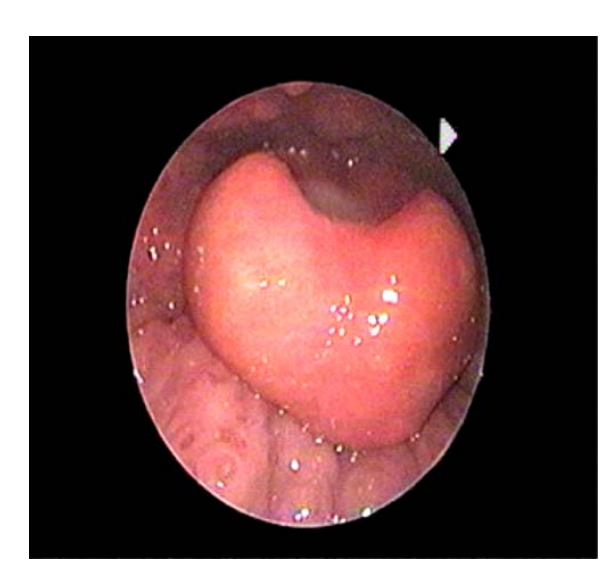
Fig. 2 Picture from flexible laryngoscopy showed swollen epiglotis

challenges for anesthetists because difficult intubation is expected. The failure to secure the airway can be fatal. Several airway managements can be used such as awake intubation (in a cooperating patient), inhalation induction (in an uncooperative patient) or tracheostomy (in severe obstruction or failed intubation). The awake intubation with fiber optic or direct laryngoscopy can be attempted in awake, cooperative, and