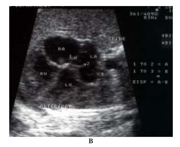
Fig. 1 The excursion index of the septum primum: